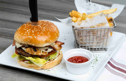
HAMBURGUESA + FRIES

*HAMBURGUESA MIXTA 16 BEEF - CHICKEN - PORK (PICK TWO) LETTUCE, TOMATO, BACON, HAM, CHEESE, POTATO STICKS FRIED EGG, MUSTARD, KETCHUP & MAYO