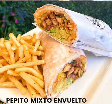
PEPITO MIXTO ENVUELTO

PEPITO BOMBA & FRIES 20 LECHUGA, TOMATE, CARNE DE PUNTA TRASERA, POLLO, CHORIZO, BACON, QUESO, PAPIAS, MAIZ, SALSAS, PAPIAS FRITAS.