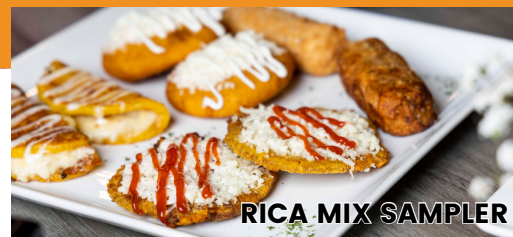
RICA MIX SAMPLER

5 MINI AREPITAS DULCES FRITAS CON QUESO 12 5 SWEET FRIED AREPITAS AND CHEESE