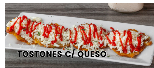
TOSTONES C/ QUESO

*Consuming raw or undercooked meats, poultry, seafood, shellfish, or eggs may increase your risk of foodborne illness, especially if you have certain medical conditions. *this items may contain undercooked ingredients