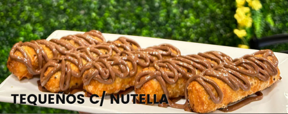
TEQUEÑOS C/ NUTELLA